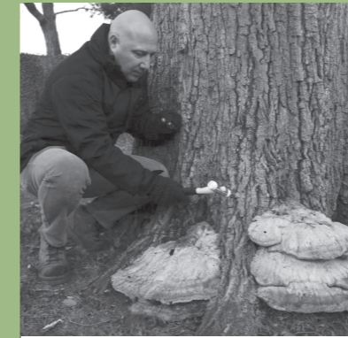
DETAILED TREE INSPECTION